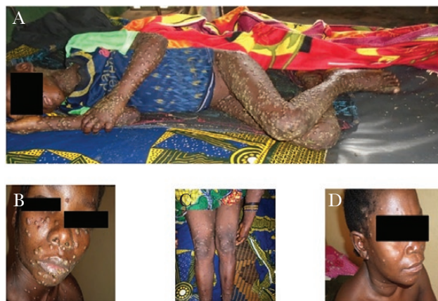
Figure 1. Disseminated cutaneous lesions consisting of macules, papules, and vesicles on the entire body of the primary case (case 1) (1A), on the face (1B) and legs (1C) of the mother (case 4), and rash and cervical lymph node of the hospital nurse (case 5) (1D).

The boys’ mother began to complain of malaise, fever, and aching muscles on December 28, 2015. The following day, a few vesicles appeared on her arms and legs. The pruritic skin lesions then spread to her entire body, except for her palms and feet. Cervical and inguinal lymphadenopathy and mucous membrane involvement were observed (Figure 1, B and C). She was still breastfeeding her younger child, who was 15 months old. This child presented 2 cutaneous lesions on December 29, 2015, without involvement of the palms or the hands or the