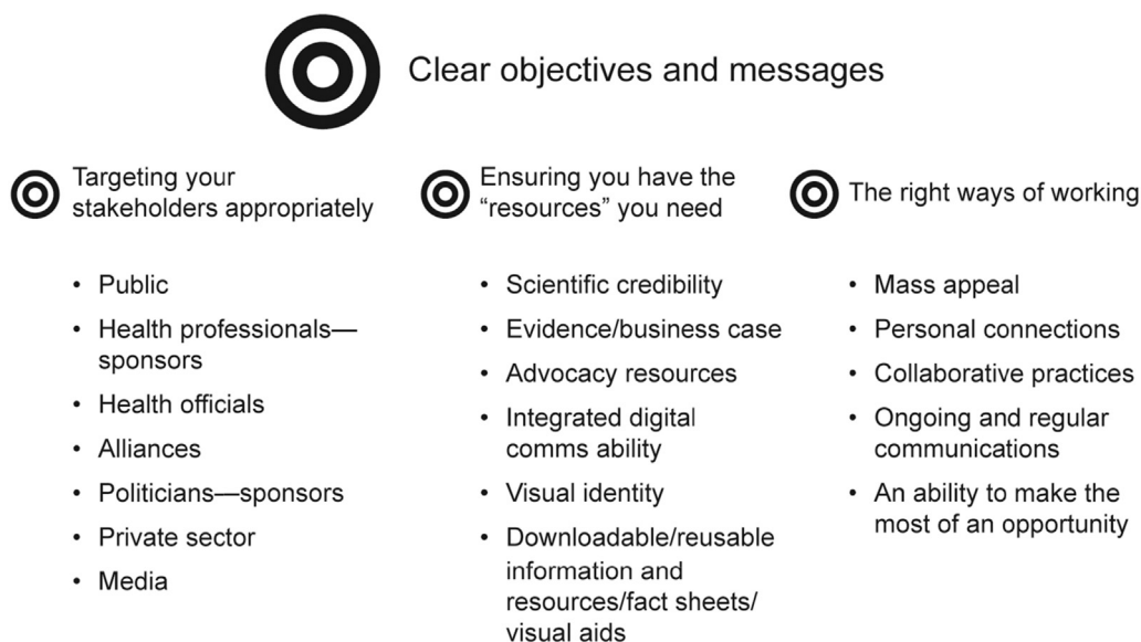
Figure 2 Possible approaches for vaccine advocacy.